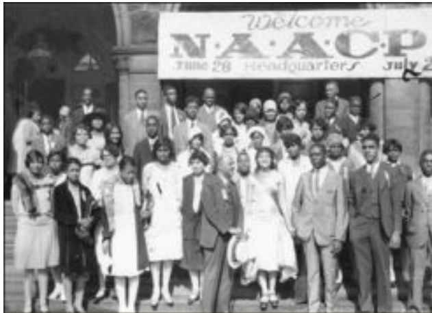
W.E.B. DuBois with Delegates in front of Mt. Zion Temple, 1929

"We have come over a way that with tears has been watered. We have come, treading our path through the blood of the slaughtered. Out from the gloomy past. Til now we stand at last. Where the white gleam of our bright star is cast."